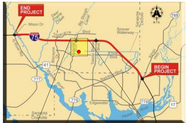
Workshop Location Map